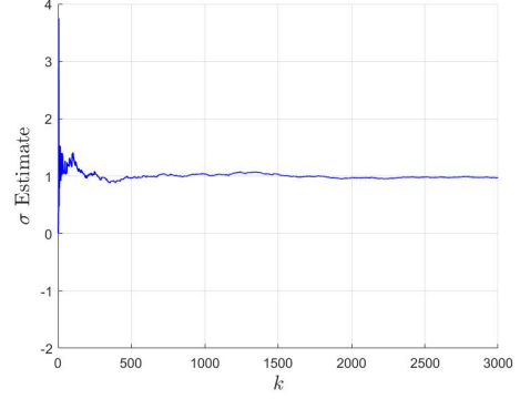
Fig. 2. Estimate of \sigma

This paper investigates the identification problem of quantized systems with a non-PE condition and Gaussian noises with unknown noise variance and mean value. The equivalent condition of the joint identifiability for unknown system parameter and noise parameters is given. Then, a decomposition-recombination identification algorithm is designed for the joint identification